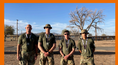
Baatan Memorial Death March